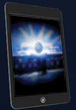
Powered by Crown

The Powered by Crown application can be used to monitor and control amplifiers connected to a single USBX device, useful for real-time in-room adjustments.